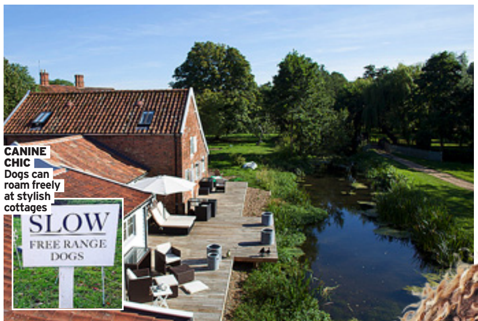
CANINE CHIC Dogs can roam freely at stylish cottages

Weekend breaks start from £395. brechfaforestbarns.co.uk