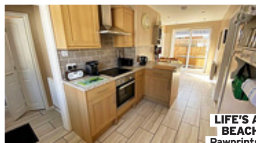
LIFE'S A BEACH Pawprints is ideal for a quiet break by the sea

Dog crates, steps, towels, bowls and poo bags can also be provided upon request. Week-long stays start from £650. pawprintsholidays.com