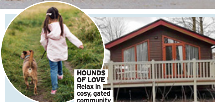
HOUNDS OF LOVE Relax in cosy, gated community