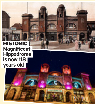
HISTORIC Magnificent Hippodrome is now 118 years old