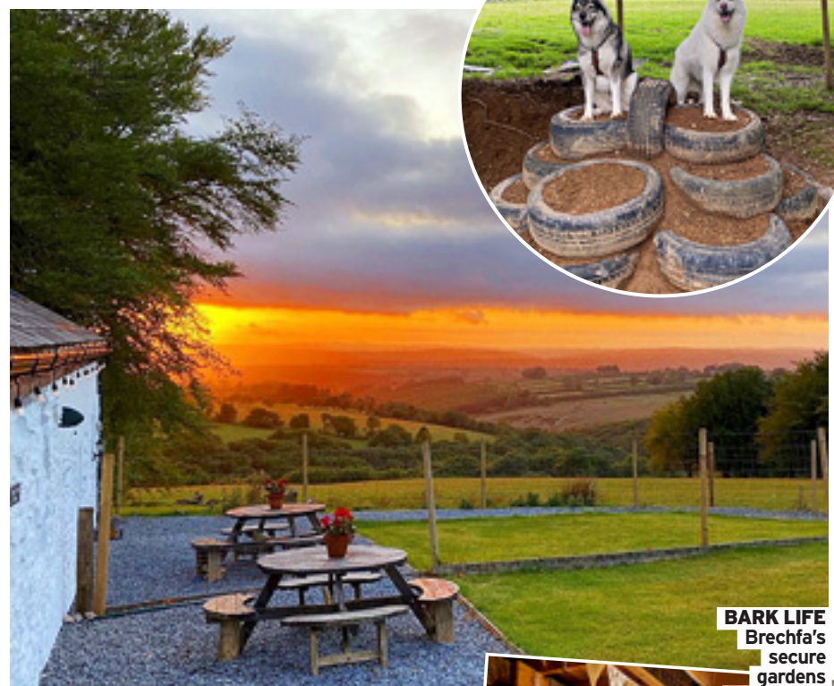
BARK LIFE Breachfa's secure gardens enjoy great scenery

The Camping and Caravanning Club will open two new pet-friendly sites on May 24. Braithwaite Village Club Site in the Lake District and Sherwood Pines Camping in Nottinghamshire feature quality facilities for families, backpackers and cyclists. campingandcaravanningclub.co.uk